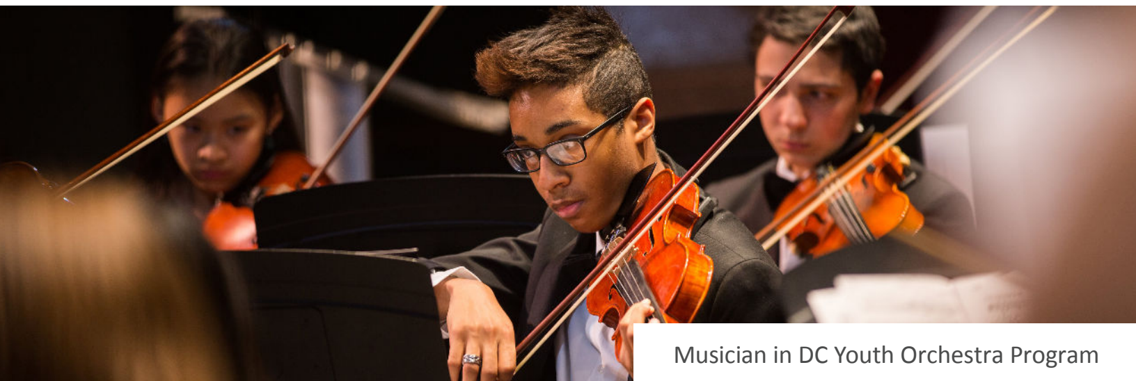
Musician in DC Youth Orchestra Program