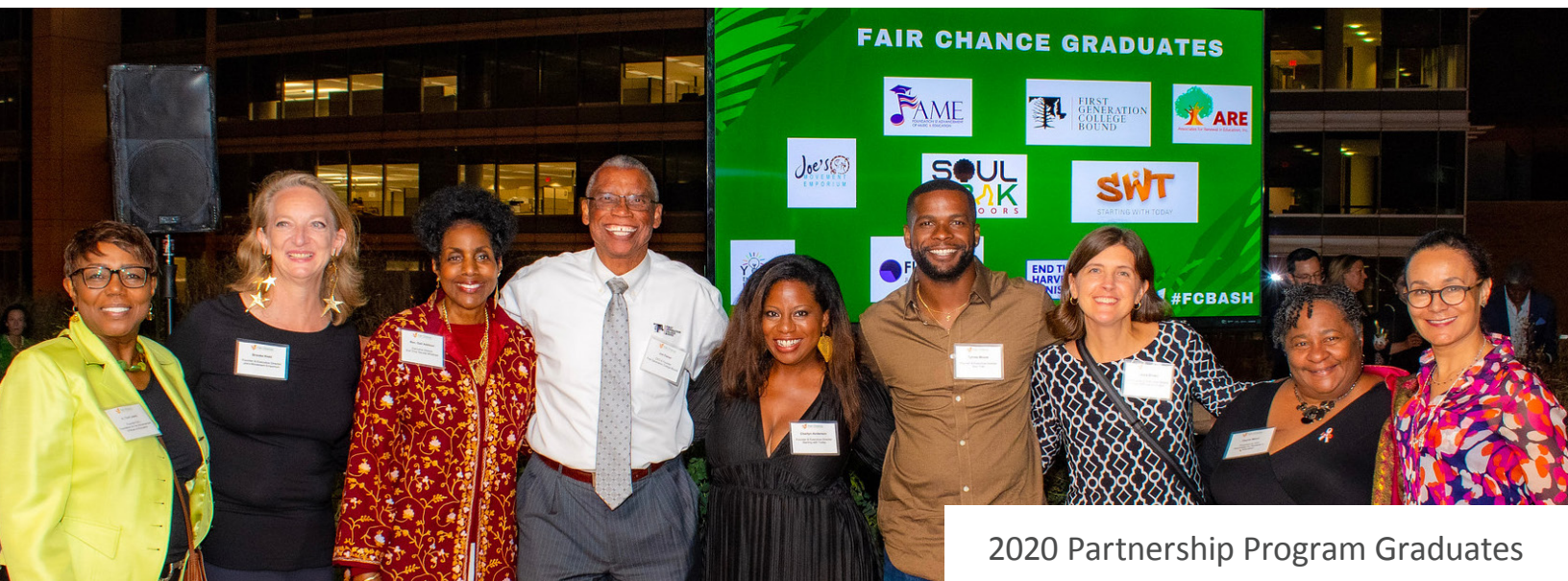
2020 Partnership Program Graduates

OUR HISTORY: Since 2002, we have partnered with 200+ community-based nonprofits, led predominately by people of color, in DC and MD, impacting a combined 150,000 children, youth, and family members.