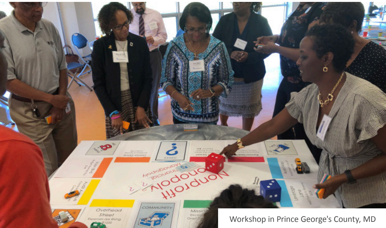
Workshop in Prince George's County, MD

OUR APPROACH: We offer free capacity-building services to meet the various needs of community-based nonprofits at different stages of development. Our programs are intensive and customized to meet the unique culture and needs of each nonprofit. Through workshops, our introductory programs introduce small organizations to the fundamentals of building a strong nonprofit. Our partnership programs are long-term, individualized coaching and training aimed at building stronger systems and practices in areas such as board development, strategy, and evaluation. Upon completing a partnership program, nonprofits join our alumni network and gain access to ongoing training, resources, and opportunities for peer learning to support nonprofit stability. In addition to our capacity building work, Fair Chance advocates for policies and practices that benefit community-based nonprofits to create a stronger nonprofit ecosystem for communities.