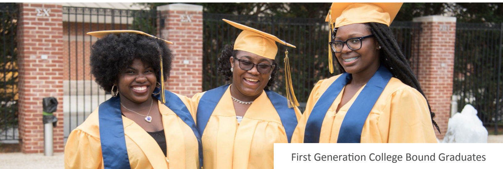
First Generation College Bound Graduates

Note: From Fair Chance's 2019 Racial Equity Framework